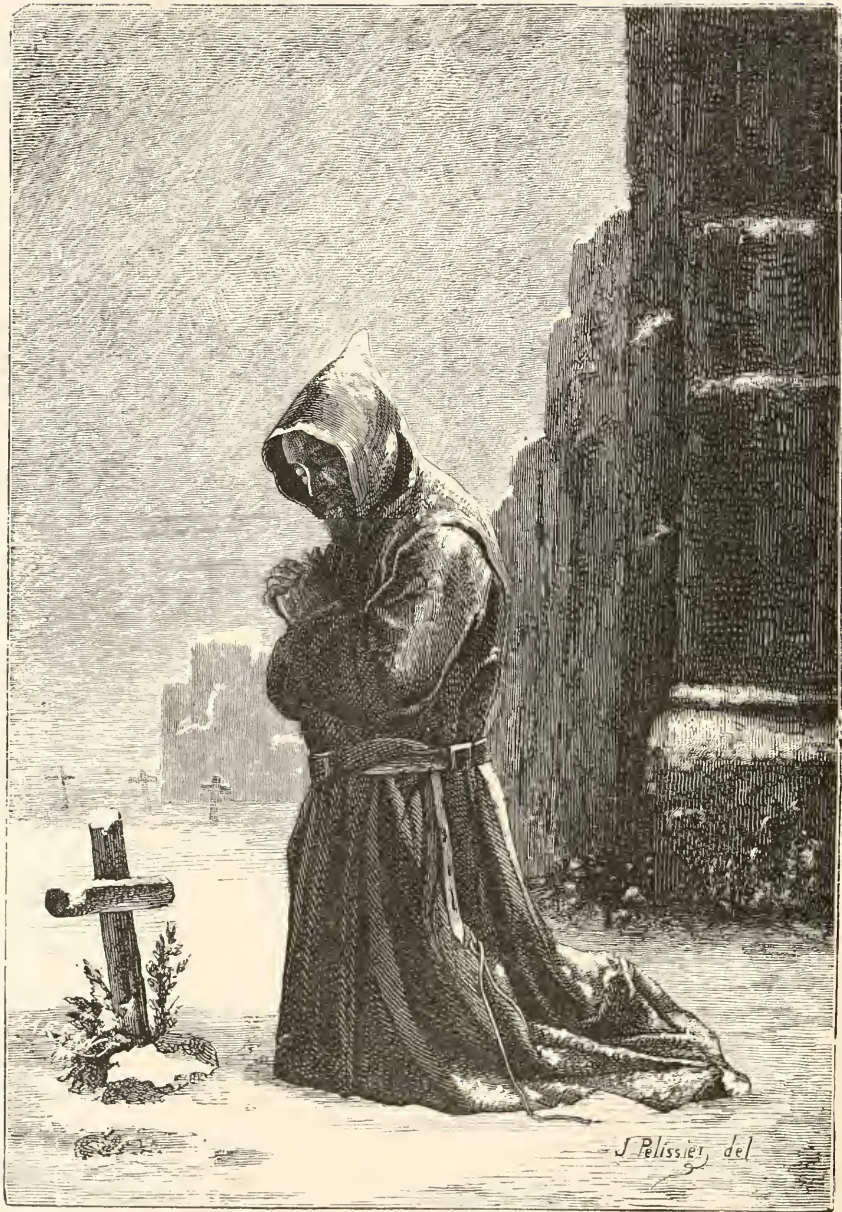
THE PALMER. — Page 635.